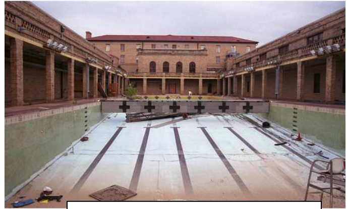
HPL Pool as it sits today.

Many of you may not know that the Huey P. Long Fieldhouse's Pool facility has been closed for the past 7 years. It has fallen into dismal disrepair, and it is disappointing to see this unique building be not only shut off from today's student-body, but be allowed to completely decay before our very eyes! This building is in crisis as evident by the photos above. The memories of this once unique and great facility has been relegated to a small tree growing where the bulkhead once hung. Not only does this pool hold a great amount of history for the LSU Tiger Swim Team, but the building as a whole is very special indeed.